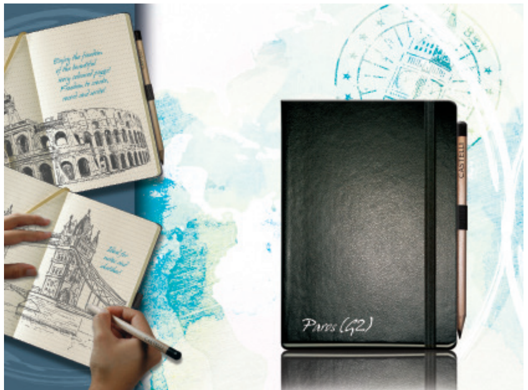
Paros notebook from « Ivory » collection