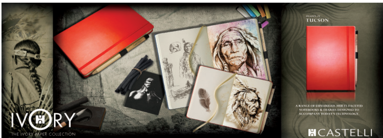
Tucson notebook from « Ivory » collection

Writer: Gérard Bourgeois www.creatis-conseil.com © 4D 2013. All rights reserved. Names and trademarks mentioned in this document are the property of their respective holders.